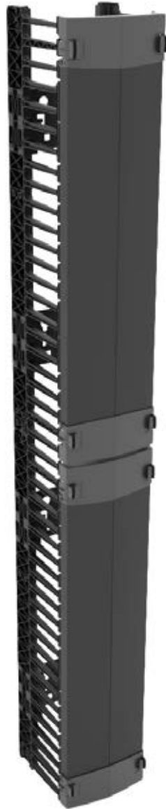
Vertiv™ Frame Rack Vertical Cable Manager Plastic