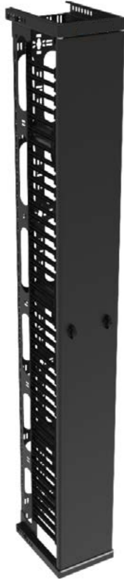
Vertiv™ Frame Rack Vertical Cable Manager

The Vertiv™ Frame Rack Vertical Cable Manager delivers a versatile and high-function cable management system for racks and data spaces of all sizes. With configurations for front-only or front/rear access, built-in cable routing fingers, and PDU-mounting options, the VCM supports both quick installations and structured cable infrastructure. Designed for flexibility and compatibility, this manager integrates with existing rack systems to maintain a clean and efficient network environment.