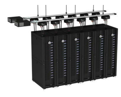
Data center with Vertiv™ PowerBar iMPB