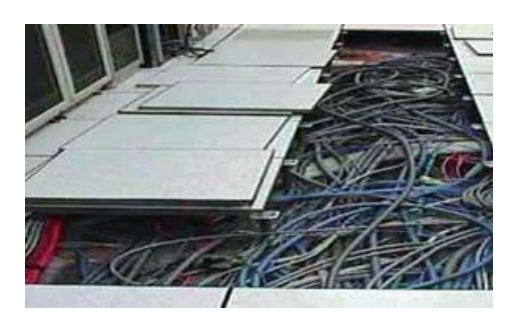
Typical data center with power cables and conduit