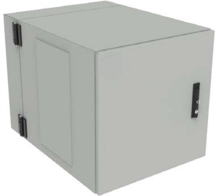
Vertiv™ Wall Mount Outdoor

Ideal for outdoor spaces, The Vertiv™ Wallmount Outdoor provides secure, organized housing for critical 19" equipment. The double-swing design offers front and rear access while protecting internal components with a locking center section and weather-sealed construction. With optional HVAC or fan/filter configurations, cable-friendly mounting rails, and lift-off hinges for easy setup, it's a rugged, space-saving solution built to meet NEMA 4 standards.