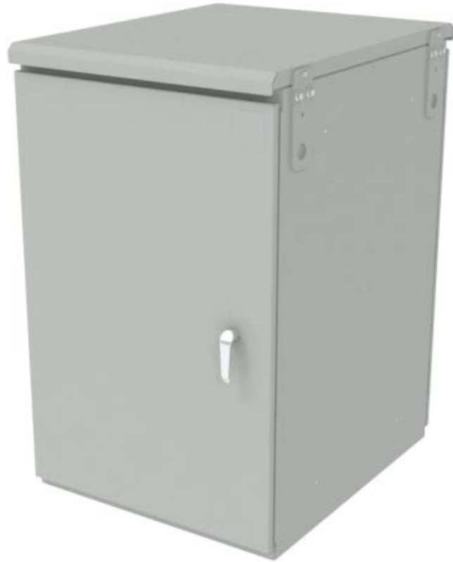
Vertiv™ Outdoor Cabinet Single

The Vertiv™ Outdoor Cabinet Single, is a rugged, outdoor-rated cabinet, built to protect and organize vital equipment for broadband, industrial, and edge applications. It supports power, fiber management, airflow, and security needs in demanding environments. With a welded aluminum frame, flexible mounting rails, built-in power and grounding options, and weather-resistant gaskets, it's ready for harsh conditions. The cabinet includes a solar shield, insulation, and is rated to NEMA 3R or 4 standards.