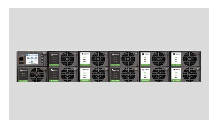
Figure 3B: When more power is needed, both 98% rectifiers and 96% rectifiers are operating and sharing the load