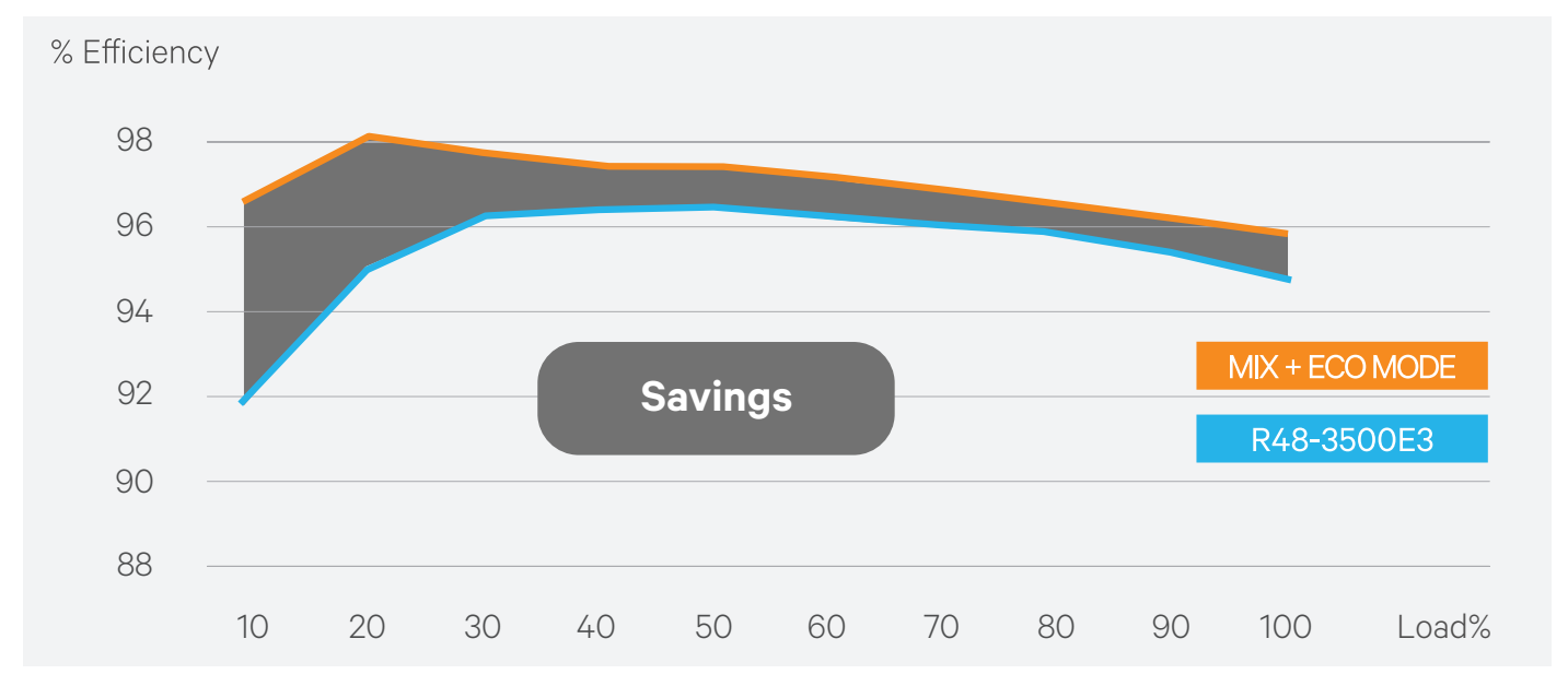
Figure 4: Upgrading 96% Rectifiers to 50-50 Mix (96% + 98%) with ECO Mode Activated