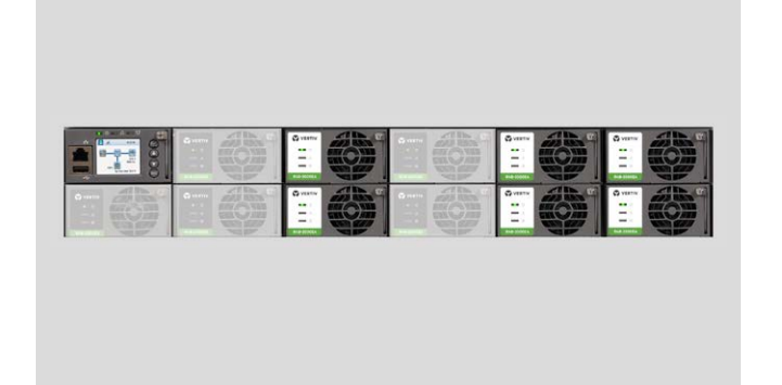
Figure 3A: NetSure™ system with ECO Mode activated; 98% rectifiers running, 96% rectifiers on standby

The result of ECO mode operation is that the system will run only 98% efficient rectifiers at normal operation. This minimizes energy loss and CO_2 emissions – but with only 50% investment in 98% efficient rectifiers. The savings are obvious when looking at the efficiency curves. Figure 4 shows the difference in efficiency between a system with only 96% rectifiers and a system with a 50-50 mix of 96% and 98% rectifiers. While the mix alone delivers energy savings, the efficiency boost with ECO mode function activated – especially at lower load – truly maximizes the savings.