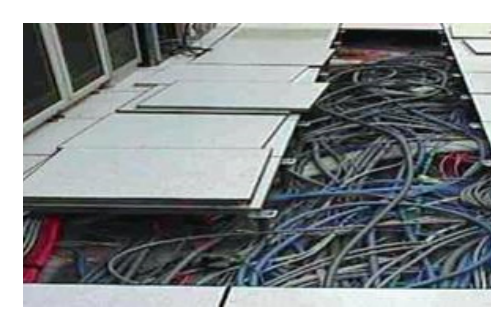
Typical Data Center with Power Cables and Conduit