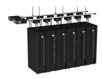
Data Center with Vertiv™ PowerBar iMPB