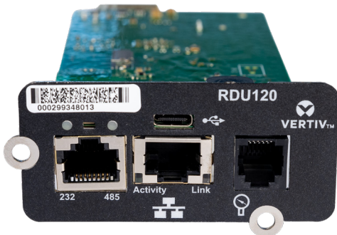
Vertiv™ Liebert® IntelliSlot™ RDU120

The Vertiv Liebert IntelliSlot RDU120 is UL2900-1 and IEC 62443-4-2 cybersecurity certified. Secure SNMP is supported via SNMP v3. The secure boot implementation prevents unauthorized tampering of the installed software. Centralized access and authorization management provides an additional layer of security via remote authentication protocols – RADIUS, TACACS+ and LDAP/AD. Port-based network access control (PNAC) (802.1X) is supported.