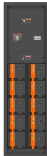
Vertiv™ HPL P1 Internal view