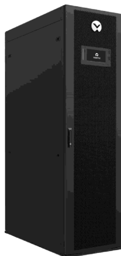
Vertiv™ HPL P1

Vertiv leverages its DNA in critical systems to deliver a lithium-ion battery system that is integrated seamlessly into the power chain. Our capabilities and processes come together to ensure the UPS, batteries, monitoring, management, service and support offerings are orchestrated for delivering on our customer expectations.