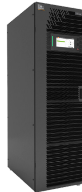
Liebert EXL™ S1 UPS 1000 - 1200kVA/kW