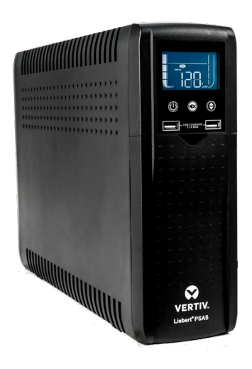
Vertiv™ Liebert® PSA5 UPS