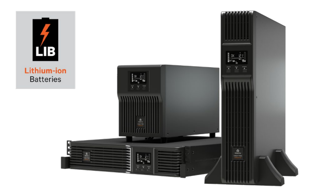
Liebert® PSI5 UPS Li-ion