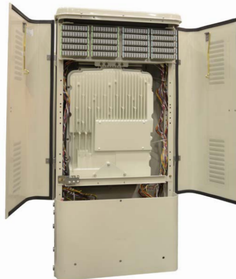
Vertiv™ BBE DSX Series (DSLAM module shown is not included)

The Vertiv BBE DSX Series Compact, DSLAM Enclosures serves as a vented above ground housing for an environmentally hardened DSLAM module, copper cross connect and cable splicing in a low count DSL application. This series is generally deployed between the central office (CO) and customer distribution pedestals. Some units may be deployed in conjunction with remote terminal (RT) cabinets, thus locating them between the RT and the distribution pedestal. In general, hardened DSLAM units are configured with limited pair counts, making them best suited for deployment in rural or other areas with lower customer density.