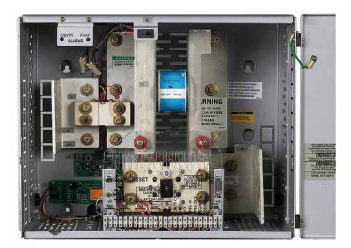
NetSure™ LBD 2000 (Open)

Safety and security features include a cover that can be locked in place during maintenance operations to prevent access to the battery fuses. A door alarm switch provides a set of contacts that will change state whenever the door is opened. Any access or operation of the door can be monitored using this feature. The door latch can also be tool-secured for restricted access.