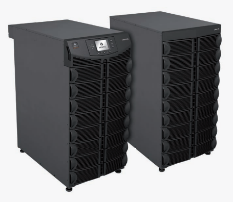
Liebert APS with matching modular battery cabinet for extended autonomy applications.

In addition, the large input voltage window capabilities further contribute to prolonging battery life and minimizing the need of transfer to battery.