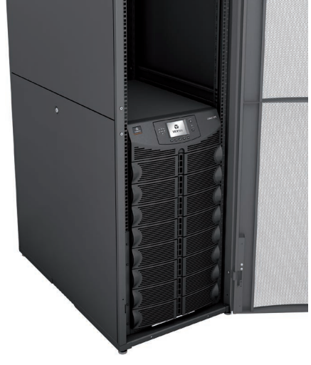
The Liebert APS UPS can be installed on raised floors, traditional flooring, or in rack enclosures.

Vertiv™ SiteScan® is a centralized site monitoring system which ensures maximum visibility and availability of critical operations. Vertiv SiteScan Web allows users to monitor and control virtually any piece of critical support equipment. Its features include real-time monitoring and control, data analysis, trend reporting, and event management.