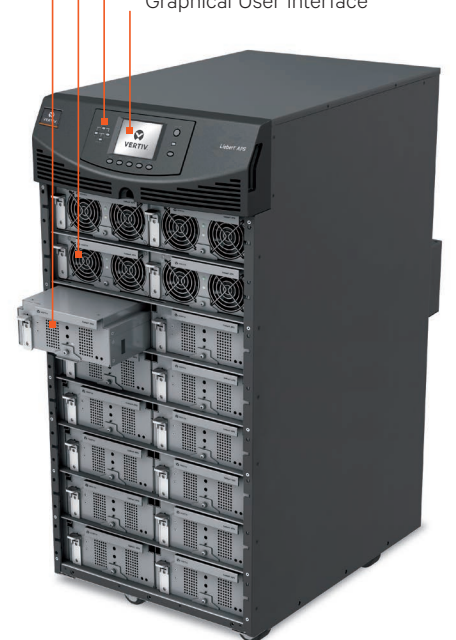
Fully populated Liebert APS complete with both power and battery modules.

Hot-swappable FlexPower assemblies and battery modules may be added without powering down connected equipment. Detachable display panel Graphical User Interface