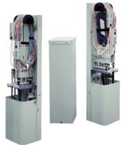
Feeder and drop sides shown installed with cover off