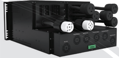
(shown above, UPS rear view with (2) PODs installed)

Rev up your engine with a compact 8 or 10kVA, 208/220V, three phase UPS that offers an intuitive control panel and fits in a rack or on the floor.