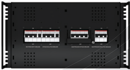
(shown above, MBC front view with cover removed)

Fill 'er up. Matching battery cabinets will meet your backup needs. Add two more for additional runtime. Batteries are easy to connect and install to keep your IT equipment up and running.