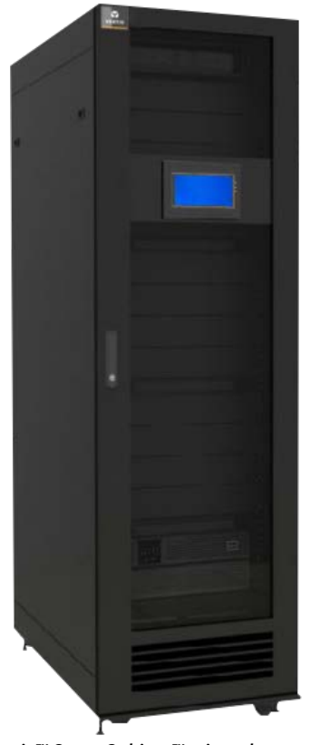
Vertiv™ SmartCabinet™ micro data center