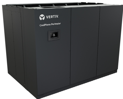
Vertiv™ CoolPhase Perimeter