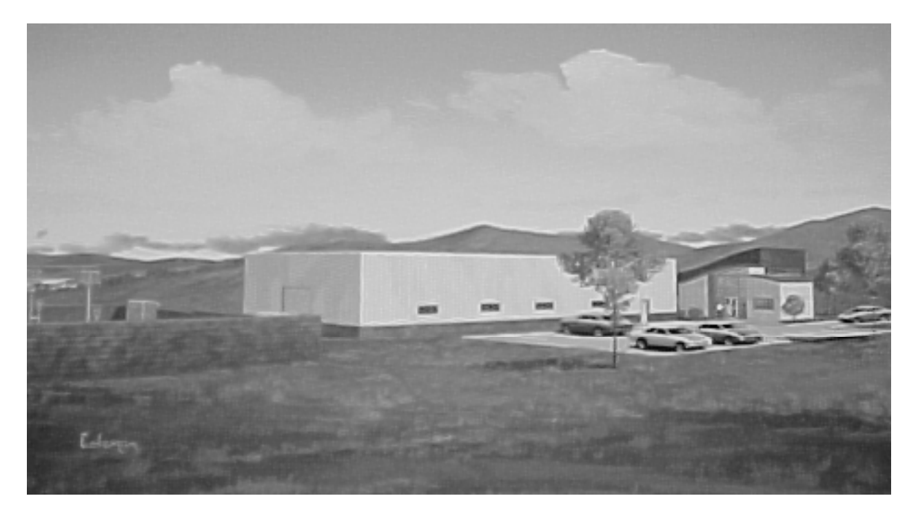
Figure 3. BESS Enclosed in Building.