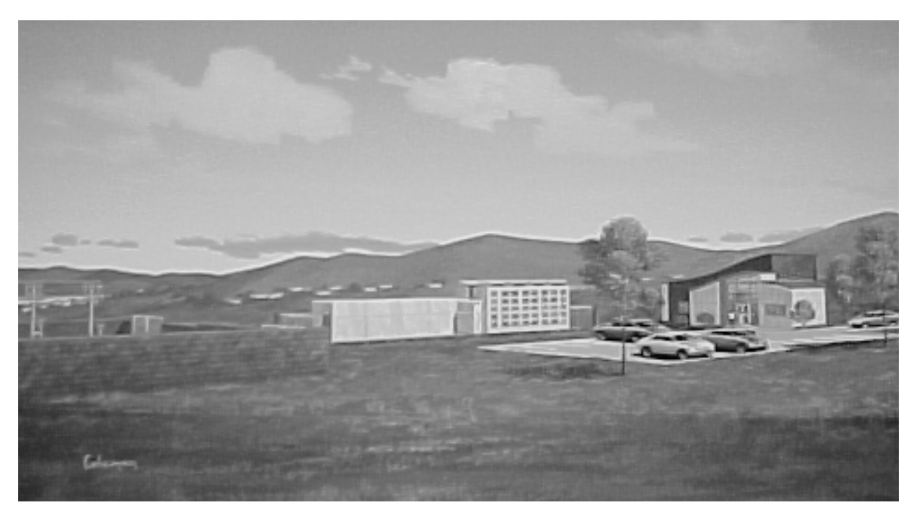
Figure 2. Stand-Alone BESS.

Table 5 provides a summary of capital cost estimates for the BESS Demonstration Unit for each of the technologies considered. "Engineering" included in this estimate is for the electrical interconnections, Visitor Center, and parking lot only. BESS engineering is considered to be included in the EPC estimate. Contingency for the battery systems is also considered to be included in the EPC estimates. Additional project contingency is assumed to be 5 percent for all technologies.